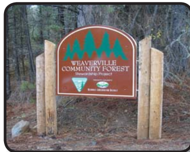
Weaverville Community Forest