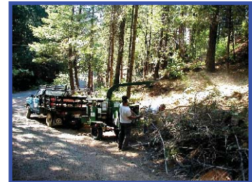
Forest Health-Fuels Reduction